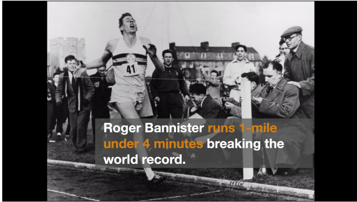
Roger Bannister runs 1-mile under 4 minutes breaking the world record.