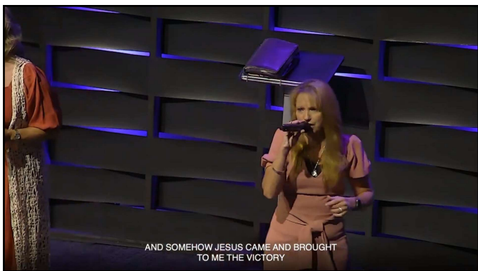
AND SOMEHOW JESUS CAME AND BROUGHT TO ME THE VICTORY